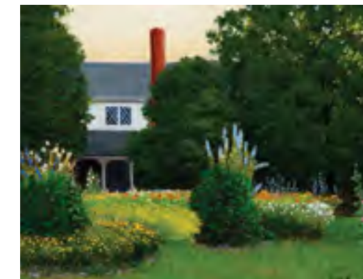
Garden, Winter Harbor , oil on canvas, 10 x 13 inches