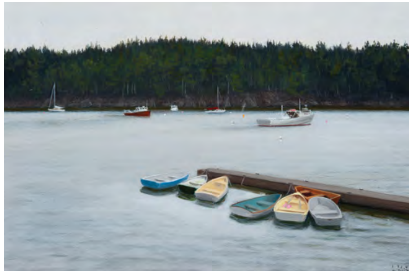
Gentle Knocking , oil on canvas, 12 x 18 inches