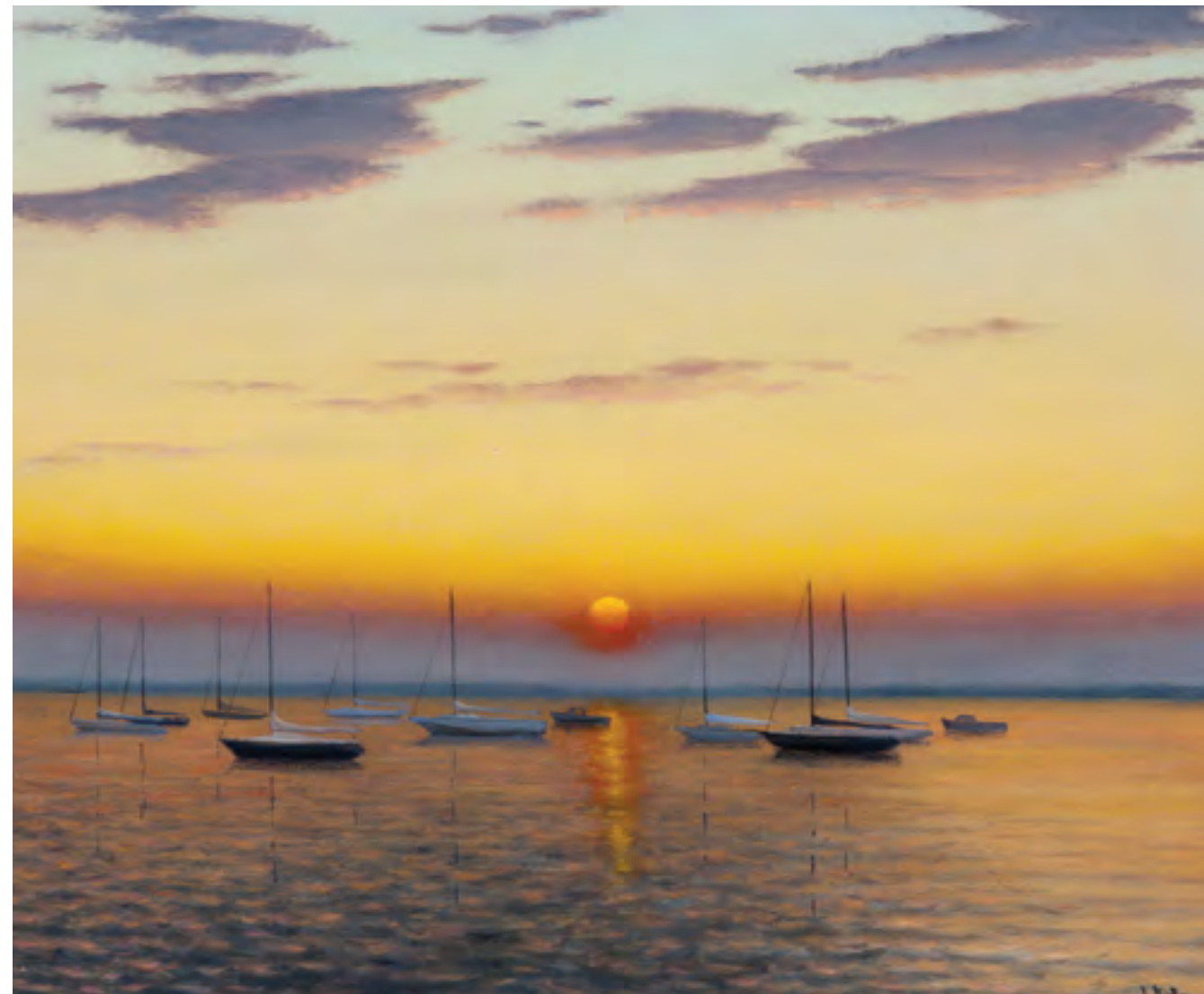
Dusk , oil on canvas, 20 x 24 inches

Carl Little lives and writes on Mount Desert Island. His latest book is The Art of Francis Hamabe.