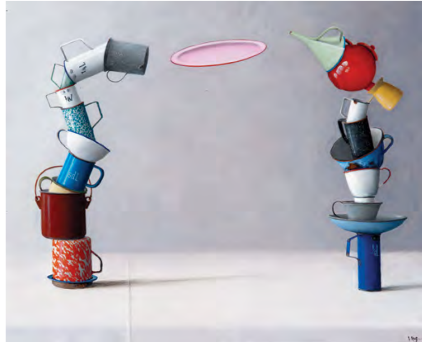
The Pink Plate , oil on canvas, 26 x 32 inches