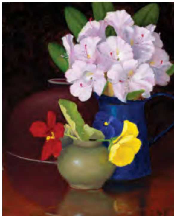
Rhododendron Blossoms , oil on canvas, 10 x 8 inches