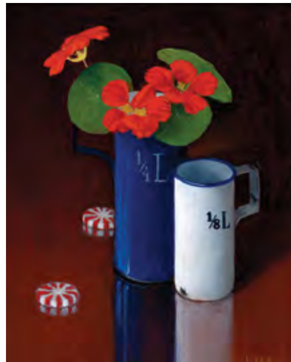
Nasturtium and Enamel , oil on panel, 10 x 8 inches