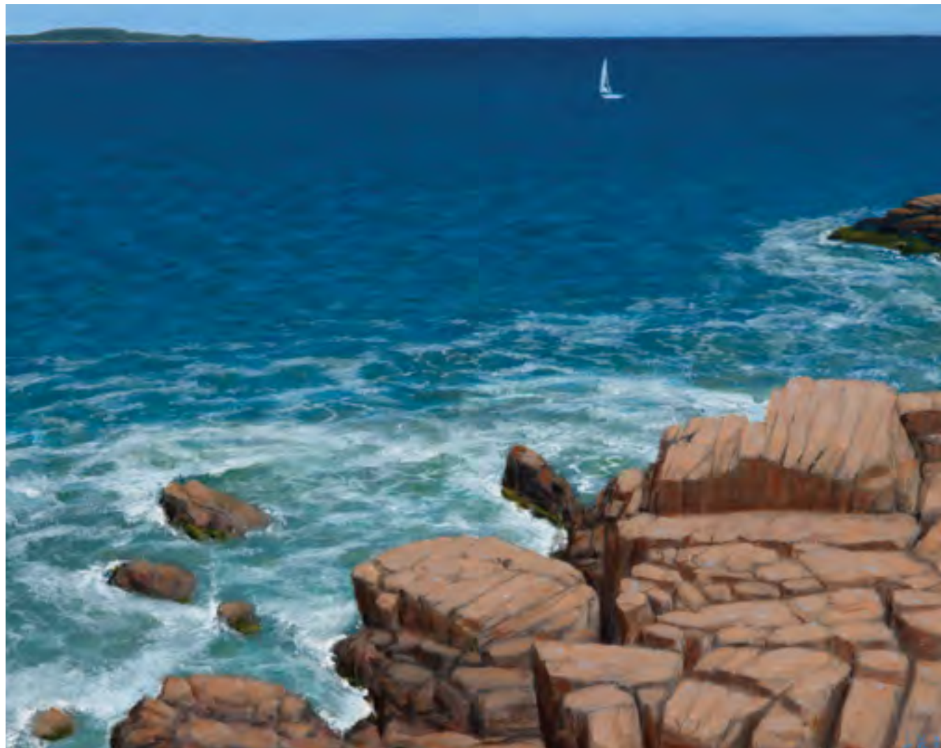
Schoodic from Acadia , oil on canvas, 16 x 20 inches BACK COVER Somesville Landing, detail , oil on canvas, 18 x 36 inches