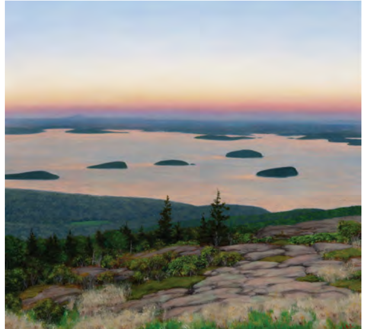
Frenchman's Bay, The Porcupines , oil on canvas, 25 x 27 inches