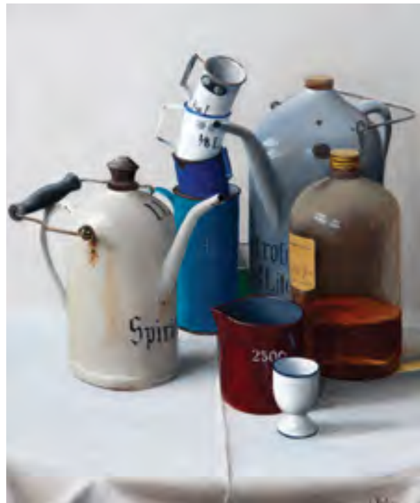
Spirits and Vessels , oil on canvas, 18 x 15 inches

Paintings of fireworks over Northeast Harbor and Sutton Island employ a profound blue reminiscent of Maxfield Parrish. Keiffer captures the light shows in mid-burst, water and anchored sailboats briefly illuminated by the pyrotechnics, smoke drifting off—transfigured night.