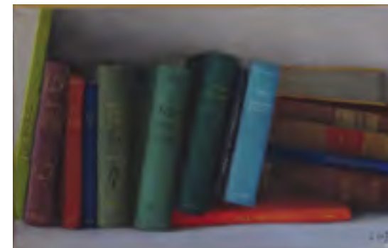
Old Books , oil on canvas, 9 x 14 inches