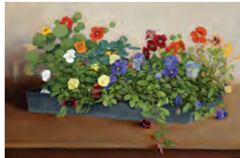
Pansies and Nasturiums , oil on panel, 16 x 24 inches

COVER Fourth of July, Northeast Harbor , oil on canvas, 28 x 30 inches