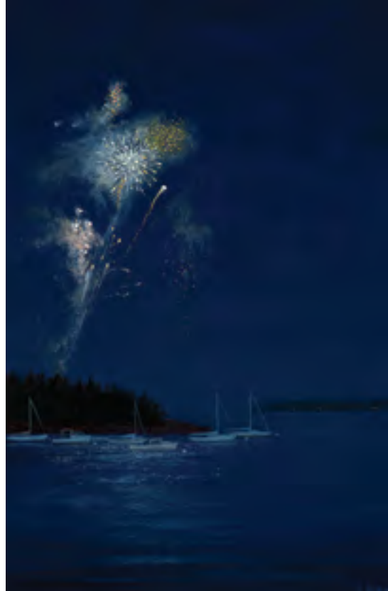
Fire Over Sutton , oil on canvas, 18 x 12 inches