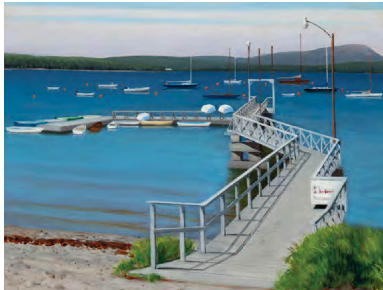
Hancock Landing , oil on canvas, 16 x 21 inches