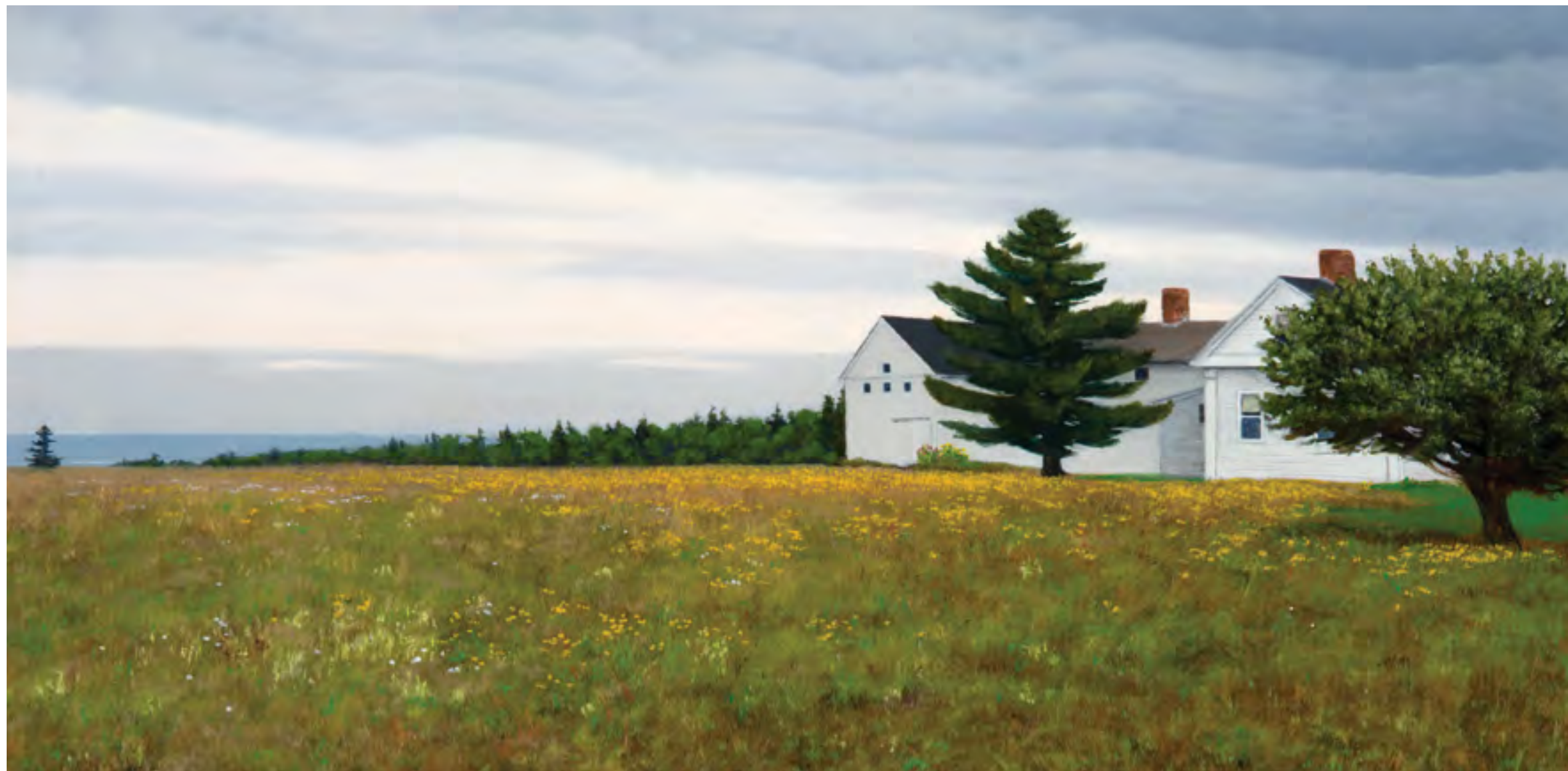
Saltwater Farm oil on canvas 20 x 40 inches