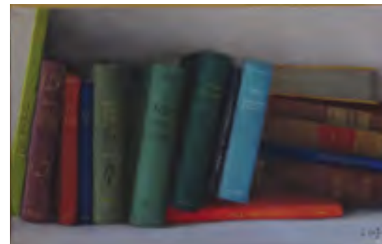
Old Books , oil on canvas, 9 x 14 inches