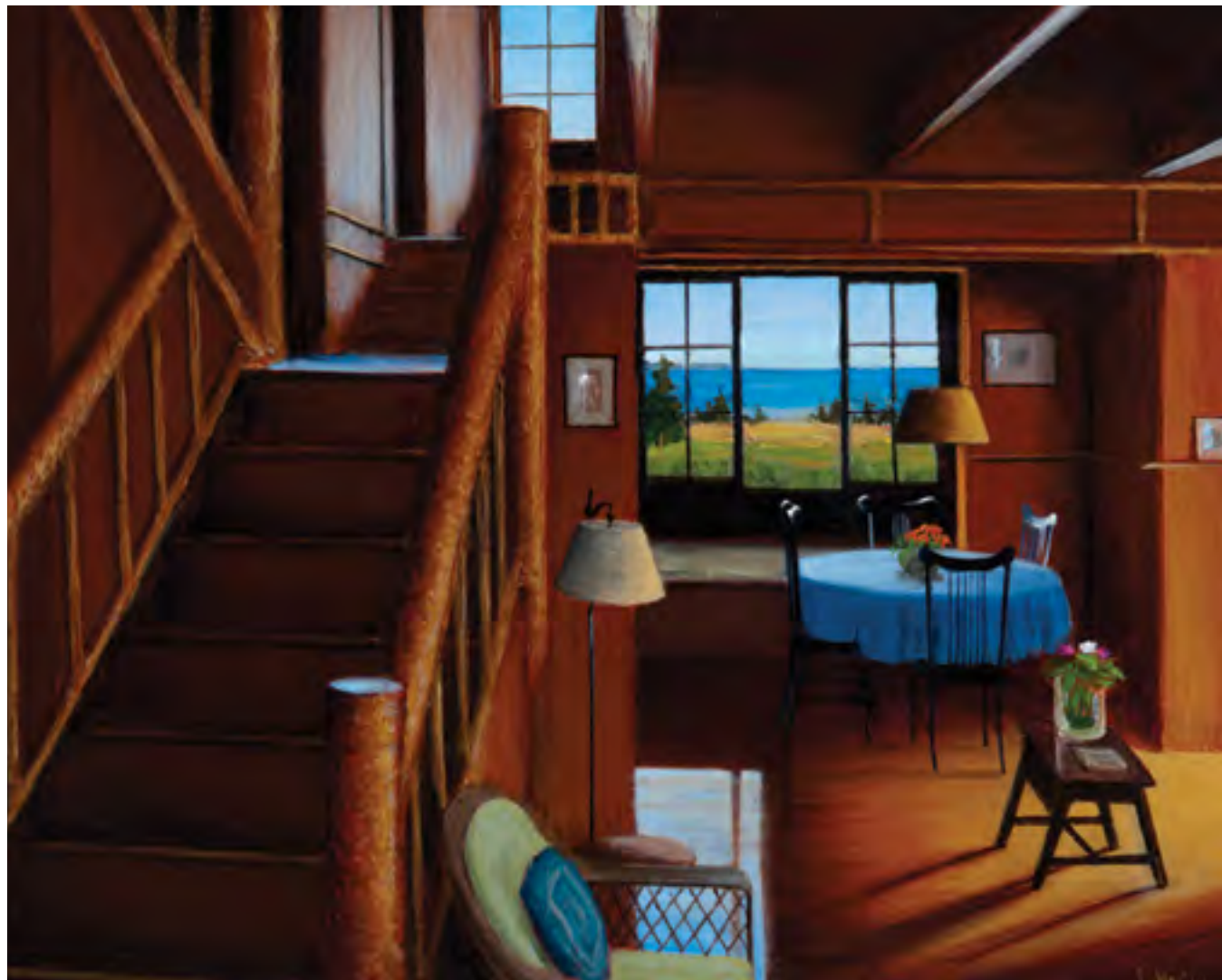
OPPOSITE A Cozy Cottage oil on canvas 13 x 16 inches