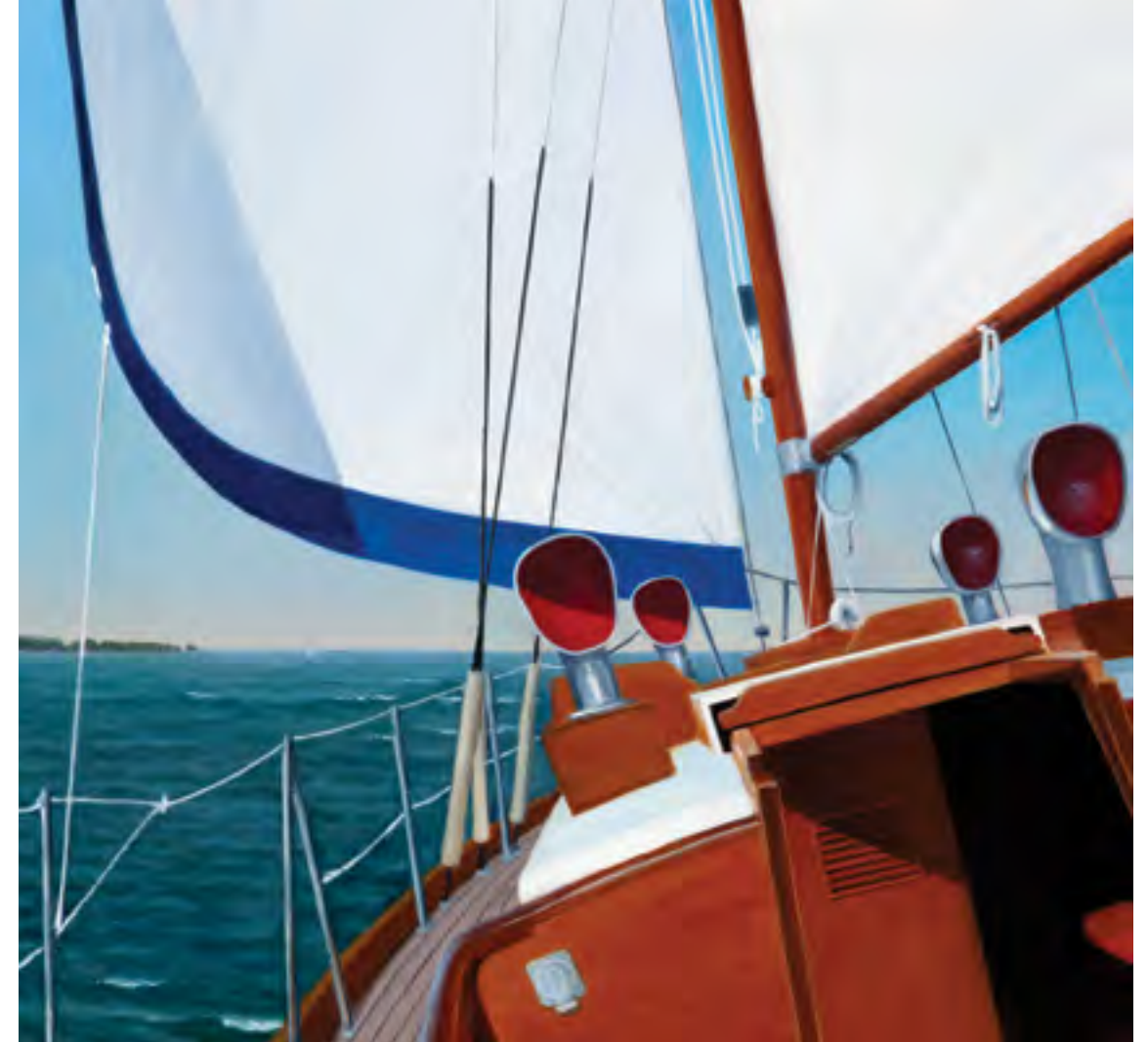
Wing and Wing , oil on canvas, 28 x 30 inches

NEXT PAGE September , oil on canvas, 20 x 50 inches